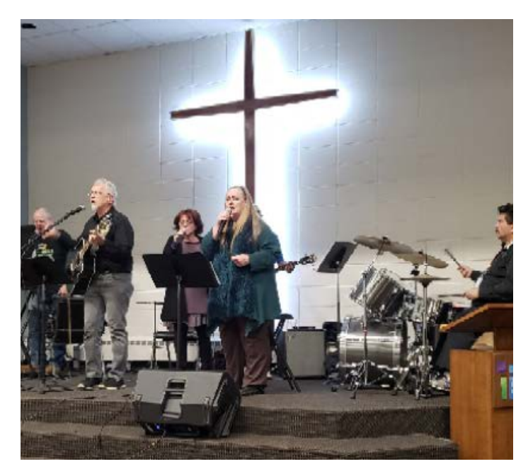
The People of Hope team (part of JICF) ministering at the Union Gospel Mission in St. Paul.