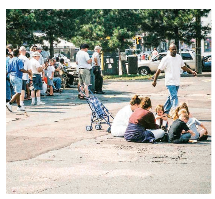
An outreach on Lake St. in South Minneapolis, ministering to many hundreds of people.