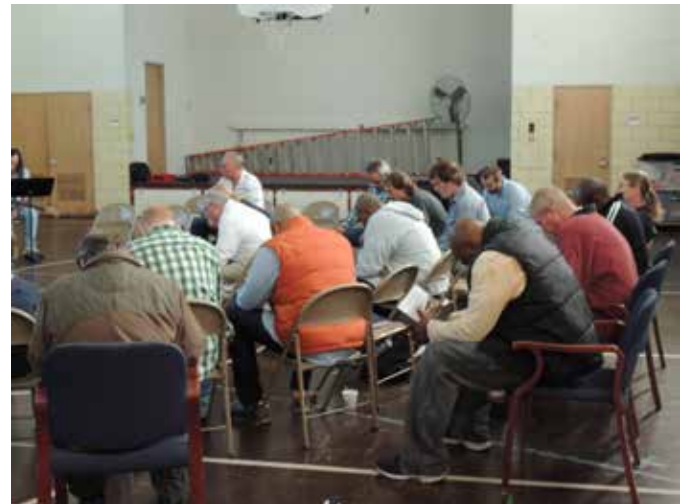
Sunday Morning Prayer Time at JICF.