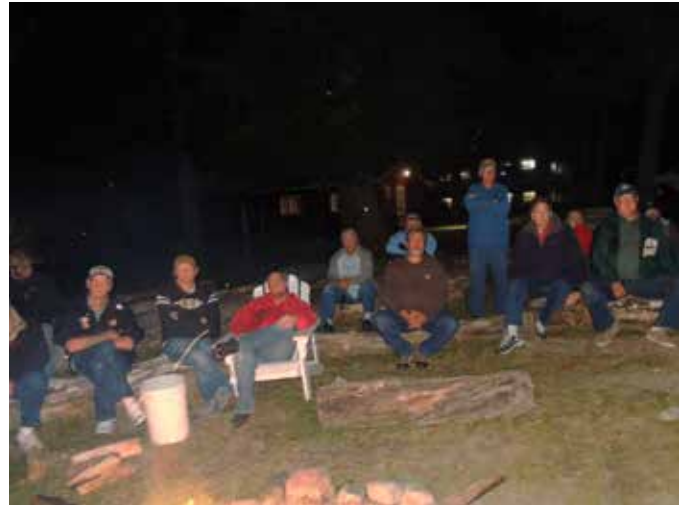
Fellowship of men at the first evening fire at Camp Luther Del on Boy Lake.