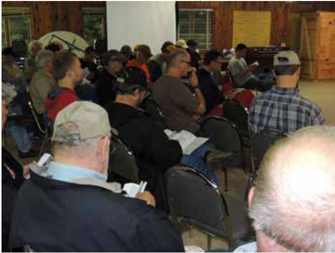
Shown here are some of the men being touched by the Word of God.