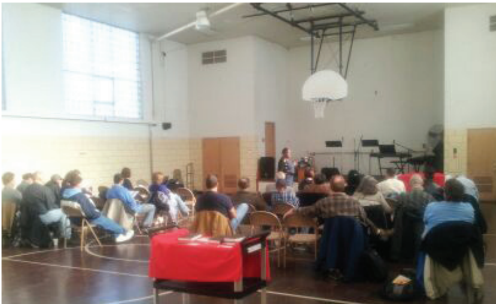
Sunday service at JICF