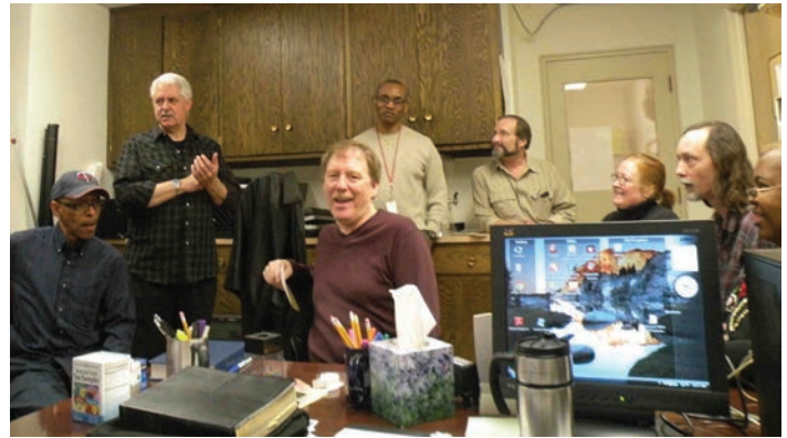
JICF Ministry team getting ready to pray before Sunday morning service