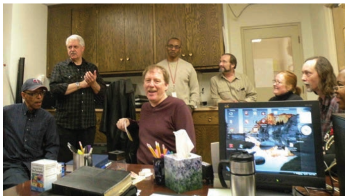
JICF Ministry team getting ready to pray before Sunday morning service