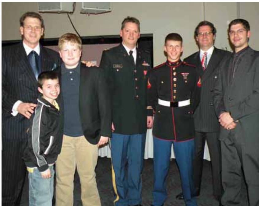
Pilla family at Fishing for Life banquet.