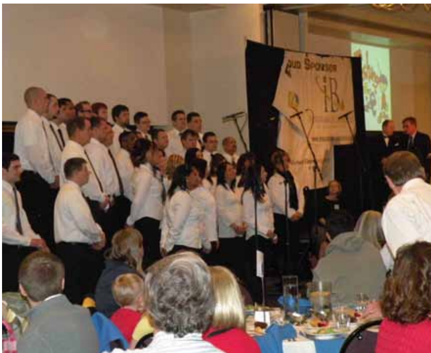
MN Teen Challenge Choir at Fishing for Life Banquet.