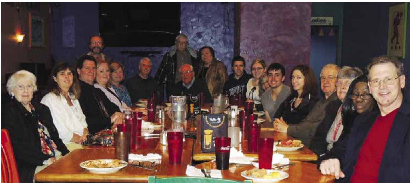
JICF ministry team having lunch at Pepito's.

God has assembled an amazing ministry team at JICF in South Minneapolis to do the work of evangelism and discipleship.