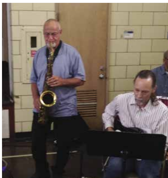
The musicians playing their instruments at a JICF celebration service on Sunday morning.