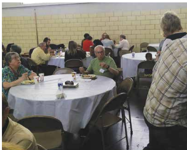
This was a potluck lunch gathering after one particular Sunday Service. Food is a great way to share the love of Christ.